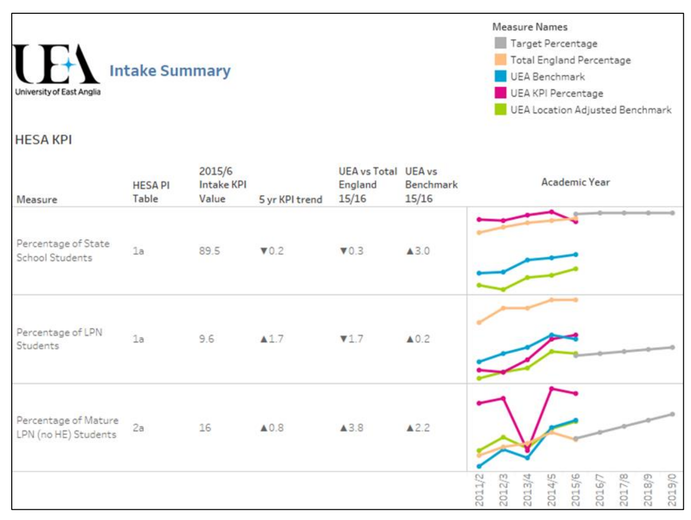
Figure 4: 2015/16 access performance indicators.

Figure 4, shows that for students from state schools and mature students with no previous experience of HE UEA performs well above our location adjusted benchmark and for young students from LPN just above.